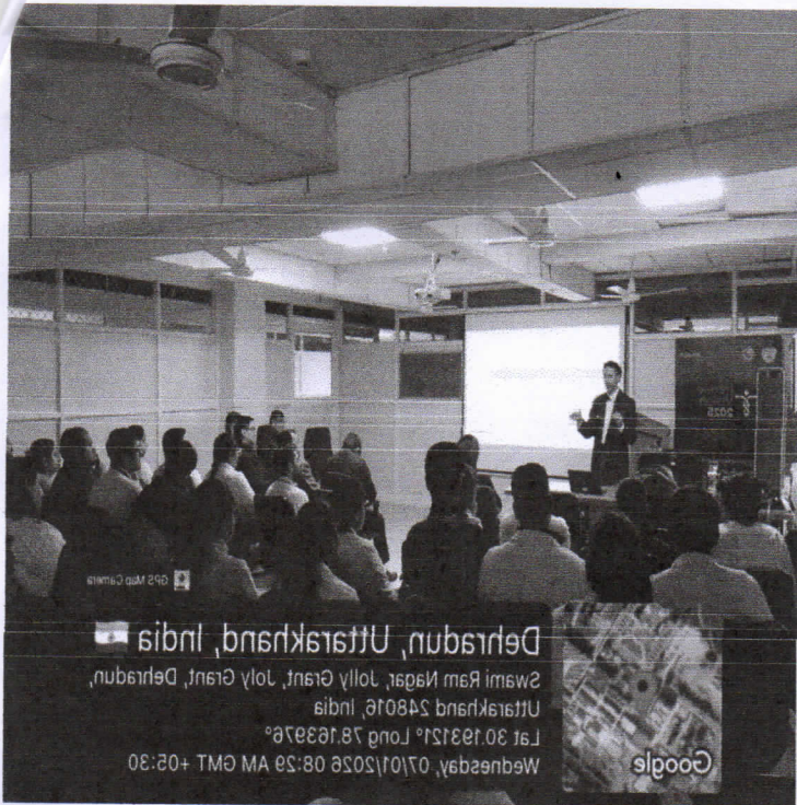
Dehradun, Uttarakhand, India Swami Ram Nagar, Jolly Grant, Jolly Grant, Dehradun, Uttarakhand 248016, India Lat 30.193121° Long 78.163976° Wednesday, 07/01/2026 08:29 AM GMT +05:30