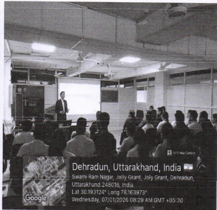
Dehradun, Uttarakhand, India Swami Ram Nagar, Jolly Grant, Jolly Grant, Dehradun, Uttarakhand 248016, India Lat 30.193124° Long 78.163973° Wednesday, 07/01/2026 08:29 AM GMT +05:30