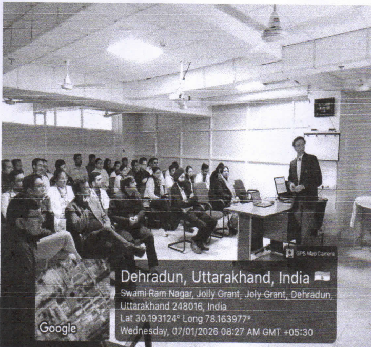
Dehradun, Uttarakhand, India Swami Ram Nagar, Jolly Grant, Jolly Grant, Dehradun, Uttarakhand 248016, India Lat 30.193124° Long 78.163977° Wednesday, 07/01/2026 08:27 AM GMT +05:30