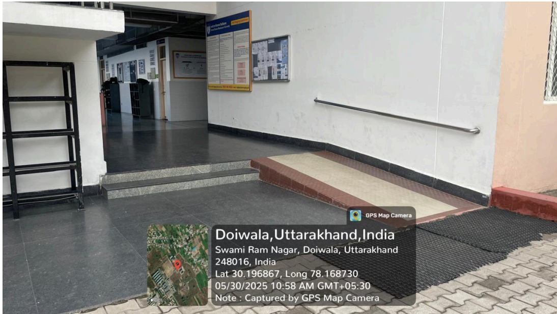
Ramp in School of Science & Technology, SRHU