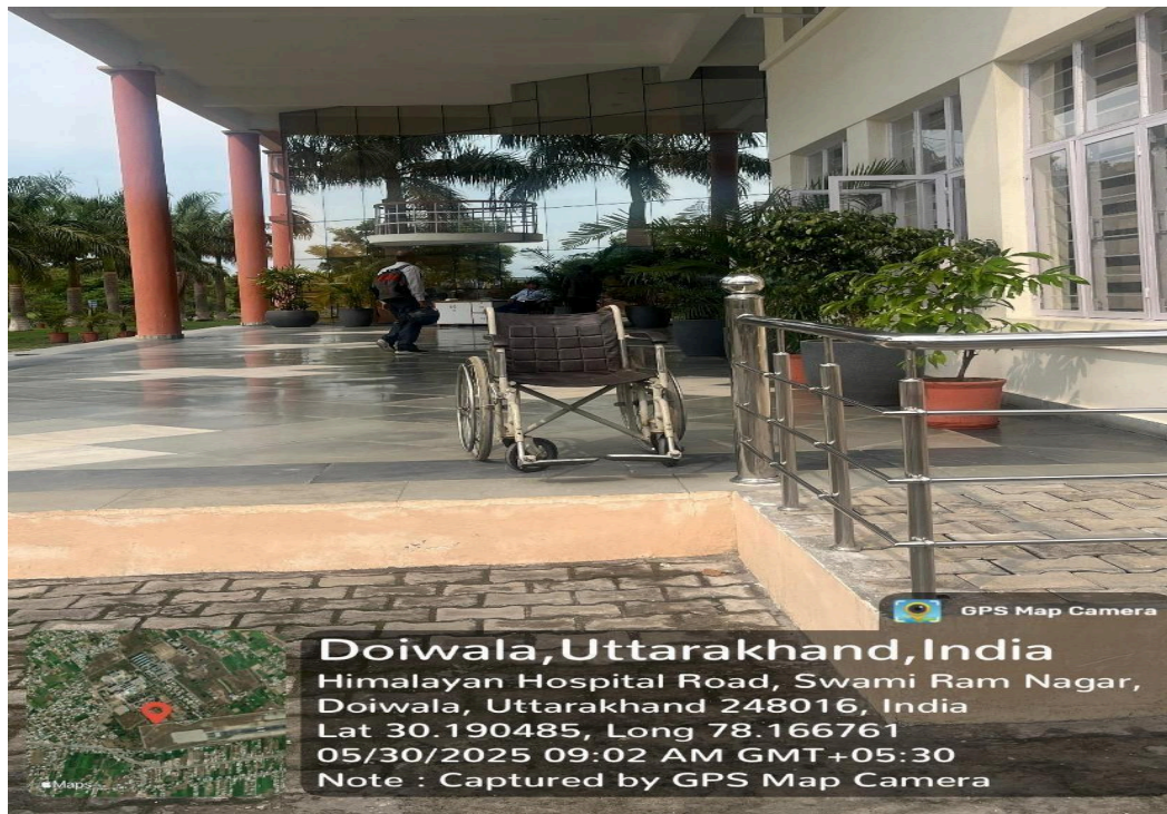
Wheel Chair Facility