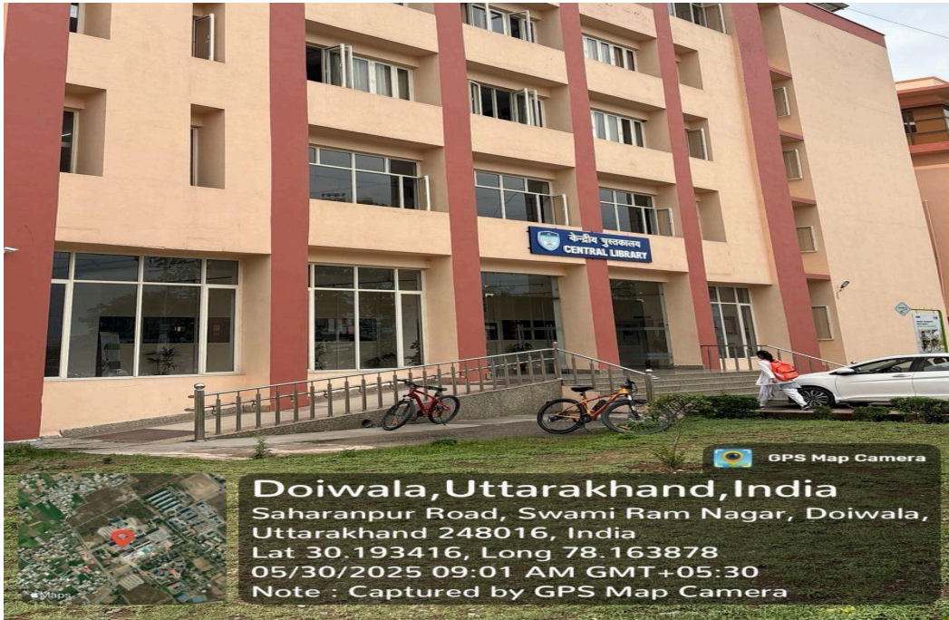
Ramp Facility at Central Library