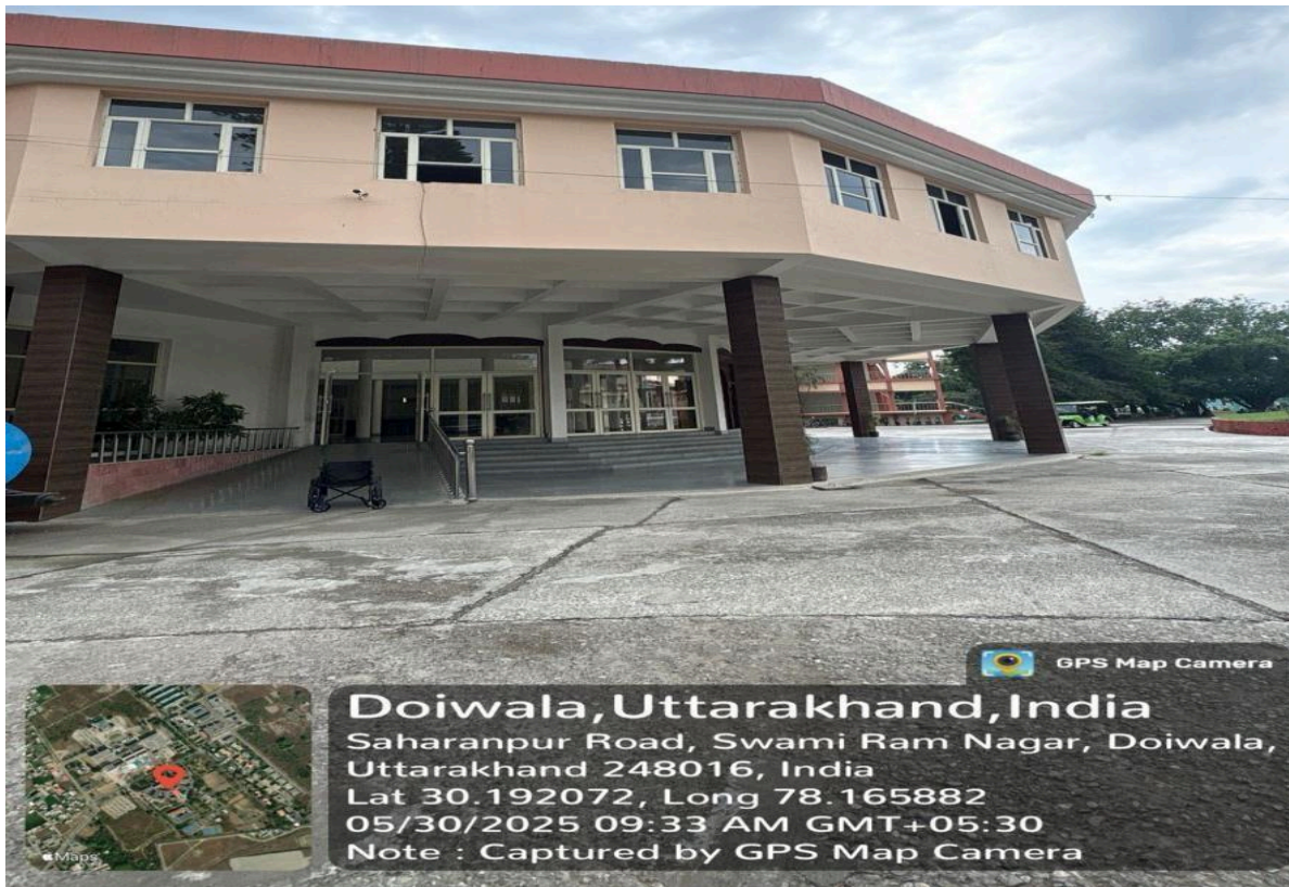
Ramp in Entrance of Himalayan Institute of Medical Sciences, SRHU