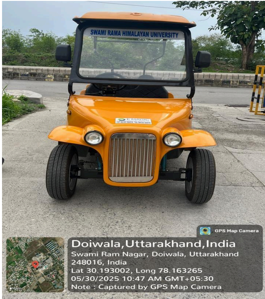
E Vehicle for the Transportation