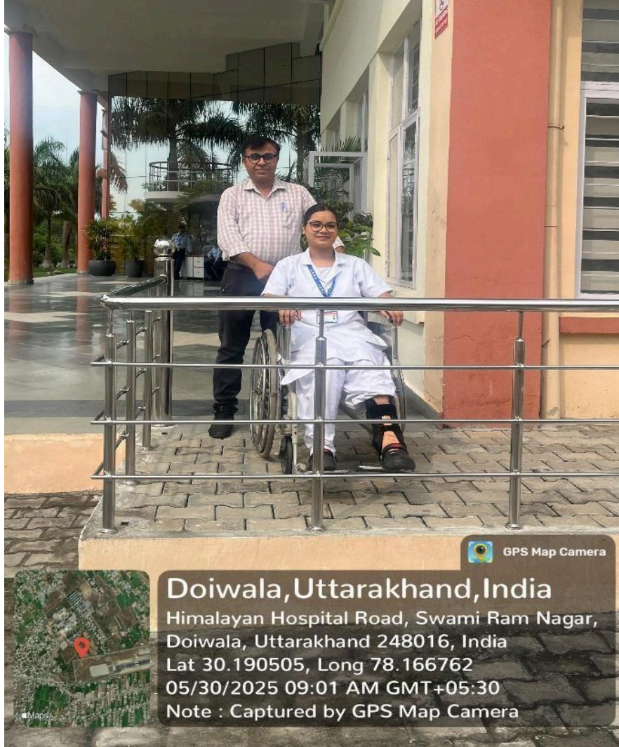
Student Using Wheel Chair With Assistance