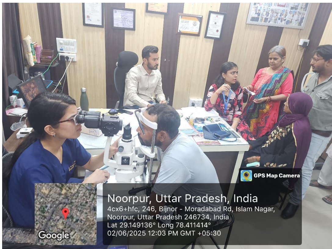
Clinical exposure: Students examining a patient's eyesight during the camp.