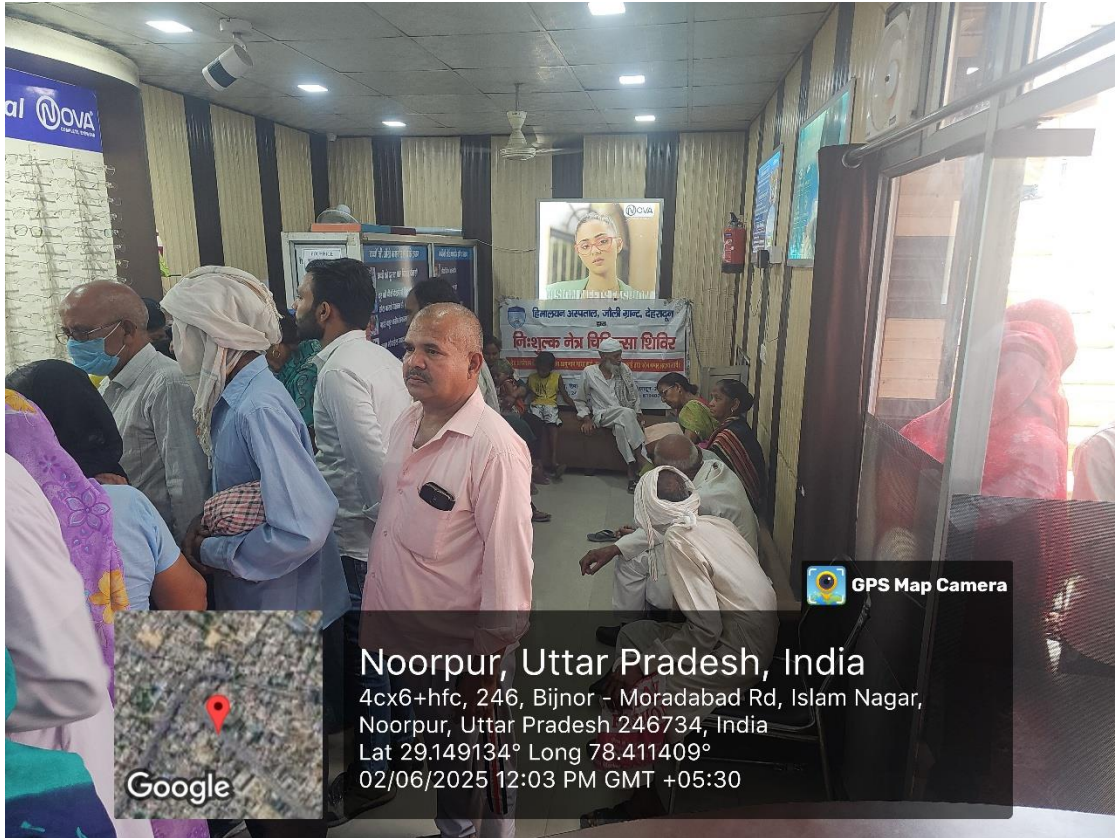
Local community accessing essential eye-care support at the camp.